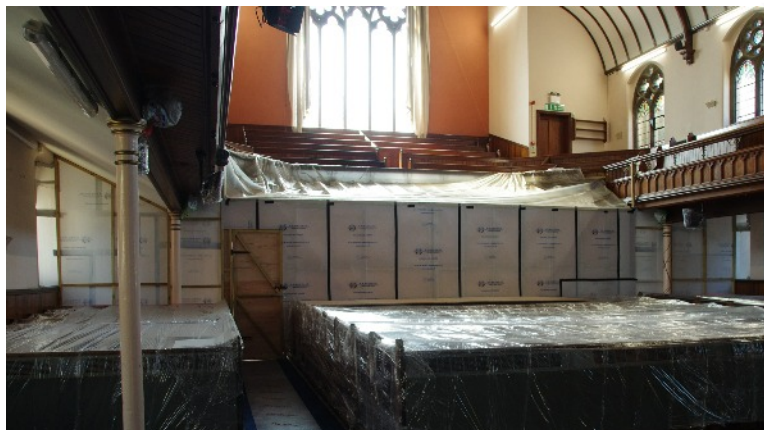
Dust screen in place and pews cling film wrapped

Photographic records are being kept and you can see these on the church web site or the photo album which can be seen at Sunday services. Nobody is allowed access to the church during the build period (other than the builder) so please do not be tempted to take a peep. Asbestos removal is immanent so this is all the more important. As this is written hoardings are going up on the Milton Road frontage and to some it may look as if we are closing. Please share the good news with friends and neighbours and let them know that we are "open for business as usual" via the Wilfred Street entrance. These are exciting times as we build for our future. Do you share the excitement?